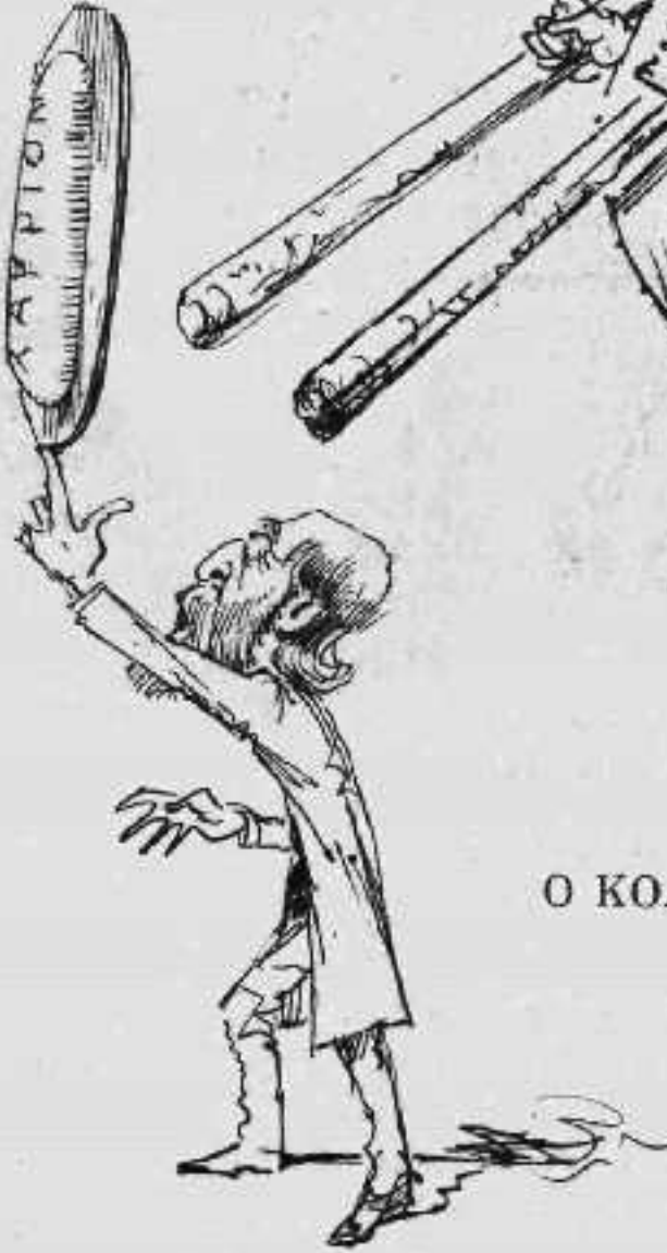
Πῶς τὸ παίζει.