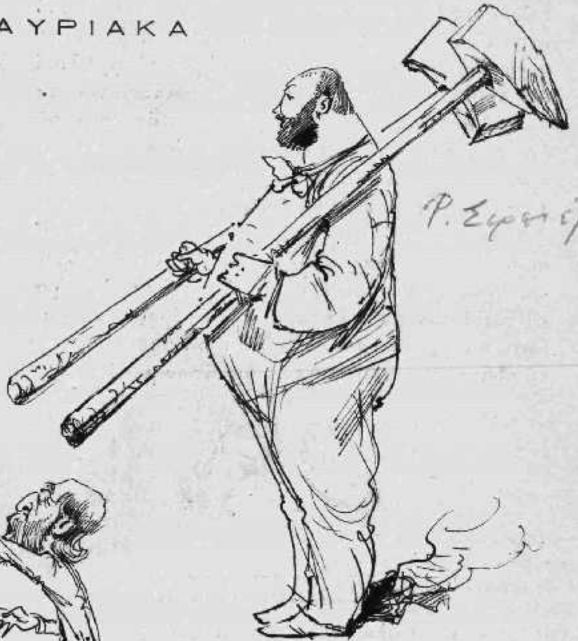
Ο ΚΟΛΟΣΣΟΣ τοῦ 1890.