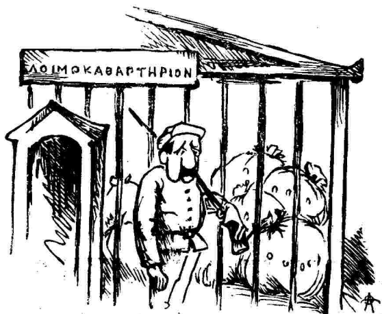
Ἡ ἄρσις ὑπὸ καθαροῦ